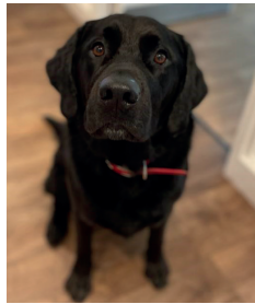
Ralph Rycroft Chief Food Tester

Our team works hard to provide meaningful, therapeutic and enjoyable activities for residents to take part in, such as exercise classes, musical performances, singing groups, gardening and arts & crafts. We encourage spontaneous activities to take place through social groups and clubs on a daily basis.